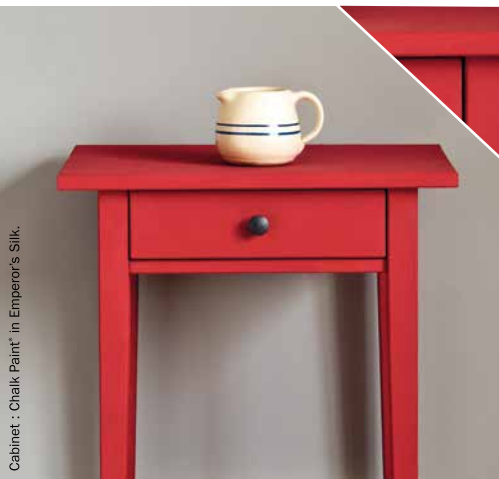
Cabinet : Chalk Paint® in Emperor's Silk.

Tip To remove excess coloured wax, use a little Clear Chalk Paint® Wax on a lint-free cloth and rub away.